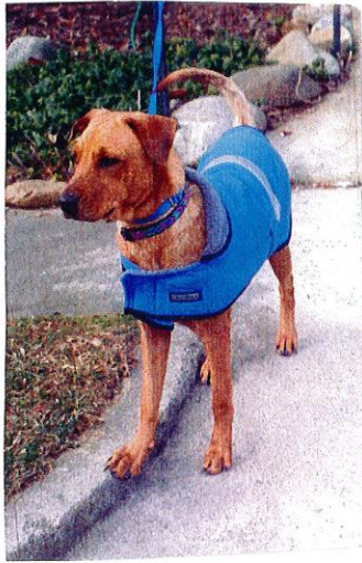
Mango in Alexandria, Va. January 2003